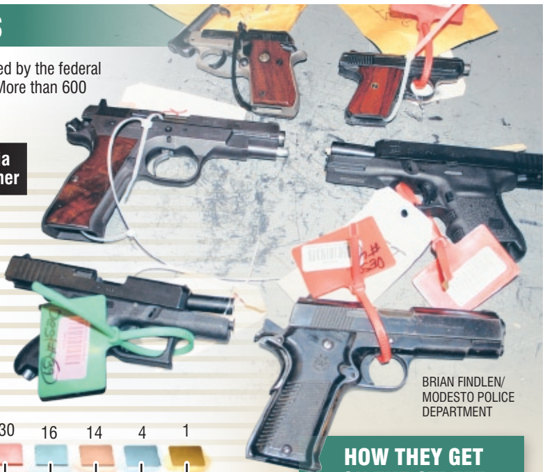
BRIAN FINDLEN/ MODESTO POLICE DEPARTMENT