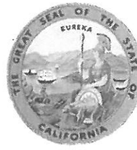
GAVIN NEWSOM LIEUTENANT GOVERNOR